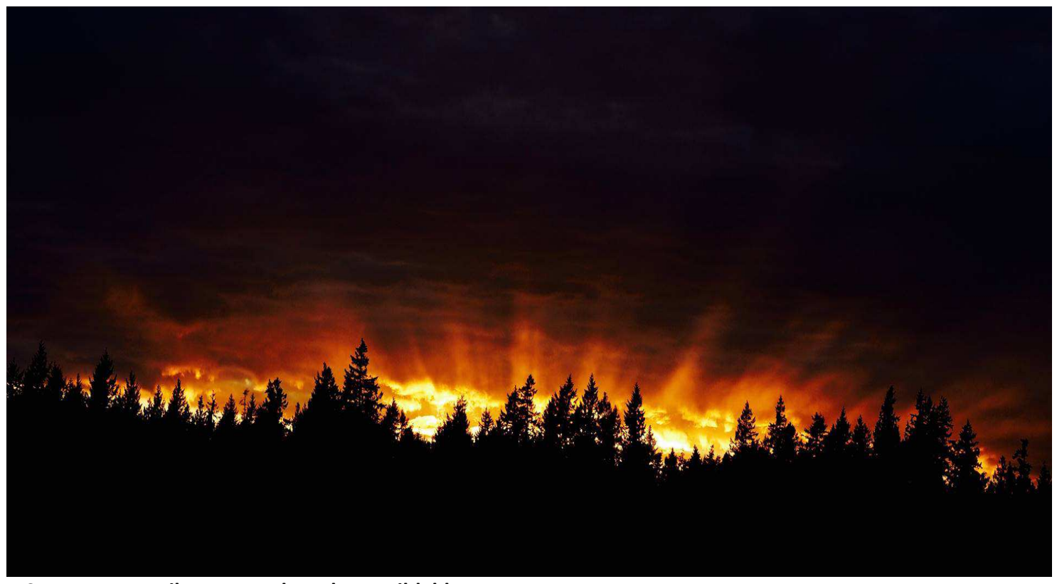
Sunset across Filucy Bay