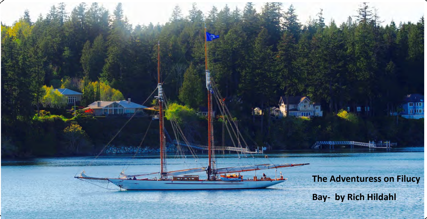
The Adventuress on Filucy Bay- by Rich Hildahl