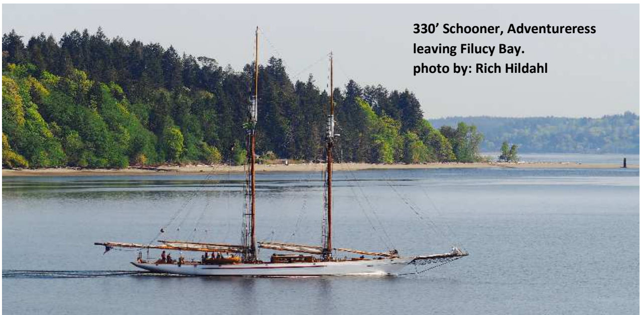
330' Schooner, Adventurress leaving Filucy Bay.