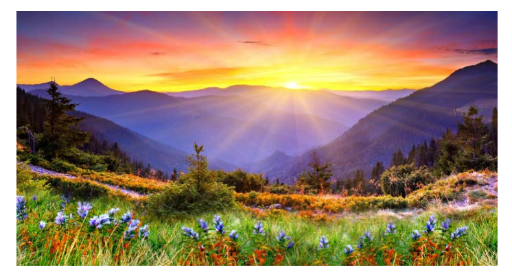
"May the flowers remind us why the rain was necessary."

I think I have been capturing all participants that have been on the monthly Zoom meetings. I appreciate the e-mails from those of you whose square is not easily identifiable. That helps a lot so I can credit all of you that are on the call. We are having around 40-45 folks call in, which I