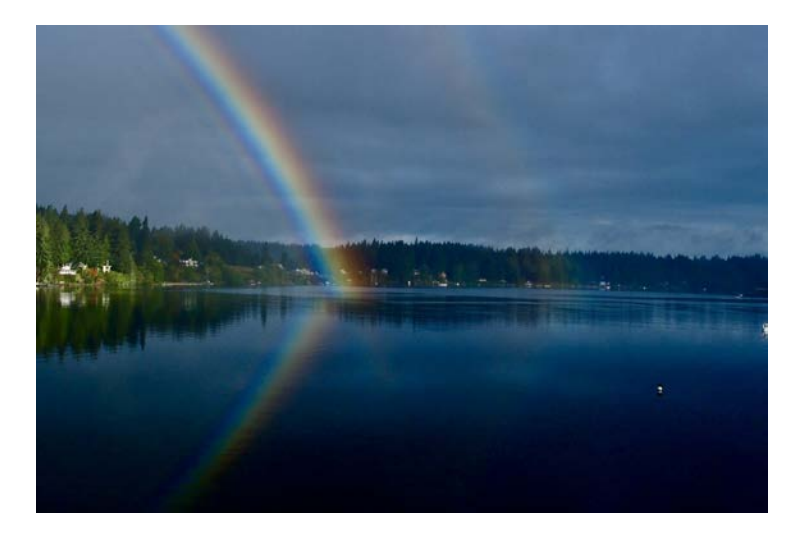
Our Key Peninsula – the protection of the rainbow.