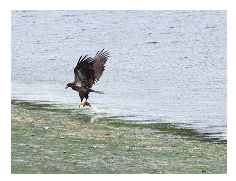
Crab for breakfast anyone. A day in the life of an eagle. A sight to see.

We have a pair of golden eagles visiting the marina – and what a sight they are. Even though we cannot hunt for crab, they can! Hope you have a chance to see them. Rich Hildahl has some fantastic pictures.